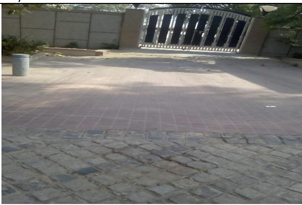
Approach road in front of gate as similar as above in terms of materials and all. Please see actual location at O/o CGM, NBCC, Pragati maidan.